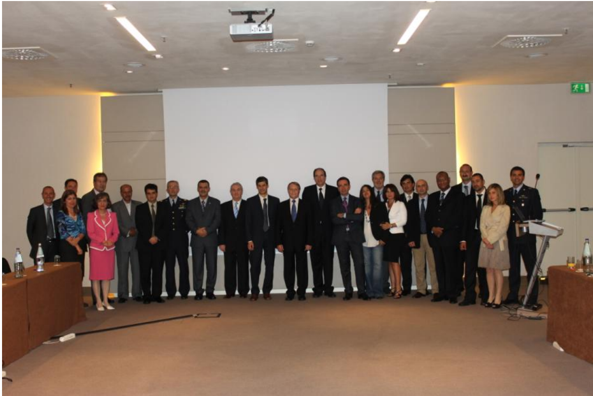
Group photo of the participants in the 5th Governing Body Meeting

ENAV S.p.A. hosted the 5th BLUE MED Governing Body Meeting, which took place in Rome on May 24 - 25, 2011. Representatives from all of the project's partner Countries (Cyprus, Greece, Italy, Malta, Albania, Tunisia, Egypt, the Hashemite Kingdom of Jordan and Lebanon) were invited to take part in the meeting.